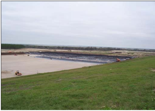
The Southeast Landfill Capacity Expansion project will add capacity for future County customers.

The program adds one new project - the Southeast County Landfill Gas Collection System. There are seven projects scheduled for completion in FY 09, and one of those projects is the Leachate Treatment Plant-New Storage Tank. This project estimated cost is $3.5 million and includes the construction of a new 575,000 gallon above-ground leachate storage tank. The purpose of the tank is to expand the leachate storage capabilities, improve leachate removal rates, and to provide sufficient storage prior to treatment at the Southeast County Landfill. The estimated operating cost for maintenance is $12,000 beginning after FY 09.