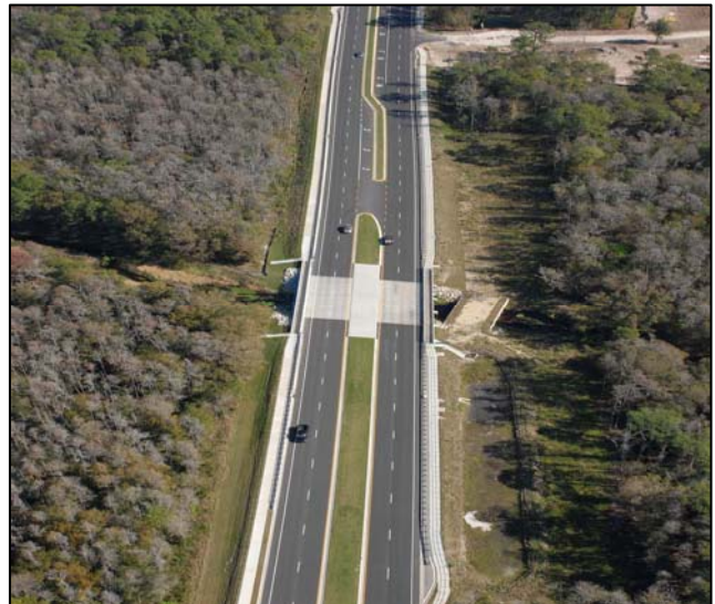
Completing the widening of Race Track Rd. will facilitate travel in northwest Hillsborough County

In addition to the $500 million approved by the Board on August 1, 2007, another significant event continuing to impact FY 09 capital budget took place in January 2002 when the Board of County Commissioners approved $132.0 million of Community Investment Tax-backed financing to accelerate critical transportation projects. This funding allowed advancing project schedules for numerous roads, intersections, bridges, and community based plan projects, as well as an Intelligent Transportation System initiative. Many of these projects are still under construction.