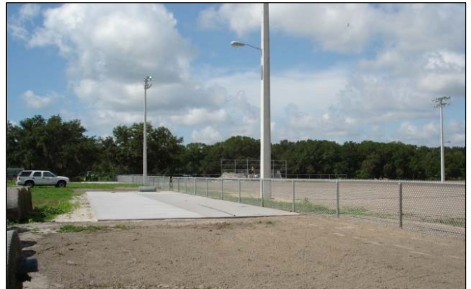
The estimated cost of improving the William Owen Pass Park is $3.5 million

The program adds twenty one new projects as part of the reallocation of the $40 million originally earmarked for Championship Park. There are four projects scheduled for completion in FY 09 - Dover Sports Complex Rehabilitation, E.G. Simmons Park Site Improvements, Lowry Park Zoo Contribution and Apollo Beach Nature Park Restroom.