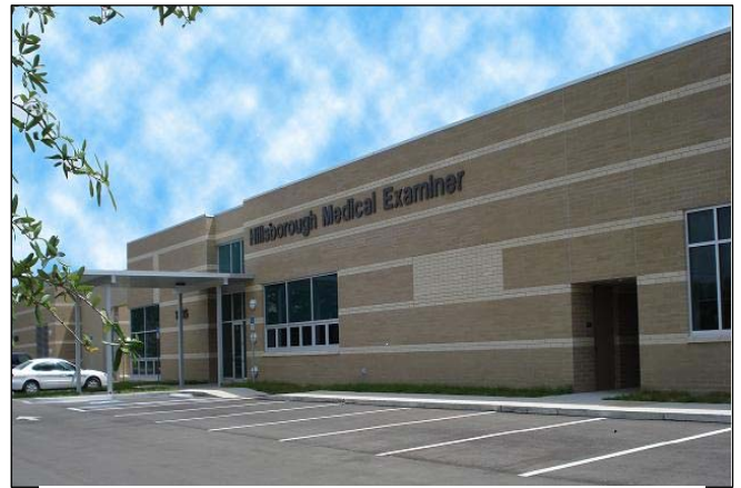
New Hillsborough County Medical Examiner Facility was completed in FY 08

The Government Facilities capital budget for the FY 09 capital budget is $55.9 million. The budget continues the program approved by the Board in September 2007. Major projects within this program include the Court Facilities Expansion, Falkenburg Road Jail Expansion Phases VI and VII, Family/Civil Court Expansion, Emergency Operations Center Interim Enhancements, Indoor Air Quality/Environmental, Children's Services Campus Enhancements, Underground Fuel Tank Replacements, Pedestrian Bridge at Main Courthouse and Courthouse Annex Maintenance Systems Upgrade.