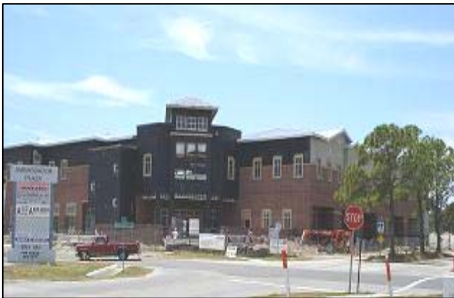
The Town n' Country Commons complex, housing the Town 'n Country Library, is currently under construction.

The Turkey Creek Partnership Library project is deleted from the program. Population projections do not justify the construction of a new library in the area for the foreseeable future.