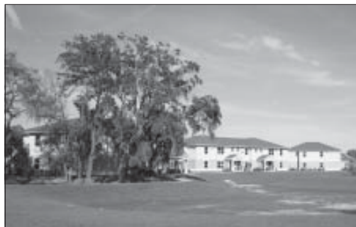
Robbins Manufacturing Company Brownfield Area After Redevelopment

1999, the Board of County Commissioners adopted the Brownfields policy to provide assistance and incentives to public and private property owners and businesses to facilitate the owner's environmental cleanup and reuse of contaminated urban property as part of the County's redevelopment and growth management strategy.