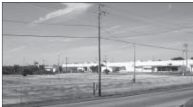
Waters Center Brownfield Area Before Redevelopment

Brownfields are real property, the expansion, redevelopment or reuse of which may be complicated by actual or perceived environmental contamination. In May