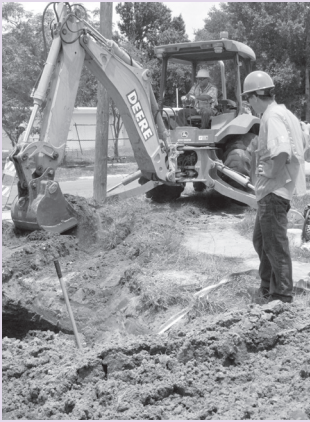
The work is taking place in several neighborhoods.

Nobody likes a dead end, including Hillsborough County's Public Utilities Department.