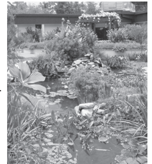
It's possible to have a beautiful yard, even in the winter, by using Florida-friendly landscaping principles.