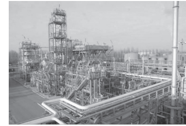
Projected used oil recycling and blending plant permitted for construction in the Port of Tampa.

EPC handles more than 1,000 requests each year for permits that impact the air, water and soils in Hillsborough County. These impacts are authorized with conditions through various agency permits. Prior to this new tracking system, applicants and the public had limited access to an individual application status unless they contacted EPC directly. This new tracking system allows residents